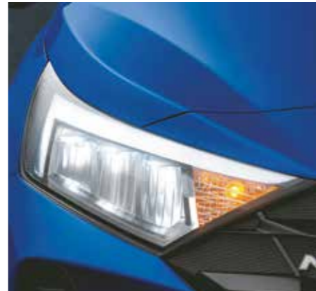
LED headlamps with signature LED DRLs