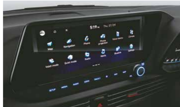
26.03 cm (10.25 ) HD touchscreen infotainment & navigation system

Connectivity comes easy in the new Hyundai i20 N Line. Equipped with cutting edge technology like home-to-car (H2C) with Alexa, fully automated temperature control, advanced infotainment with multilingual user interface, you've got the world at your fingertips.