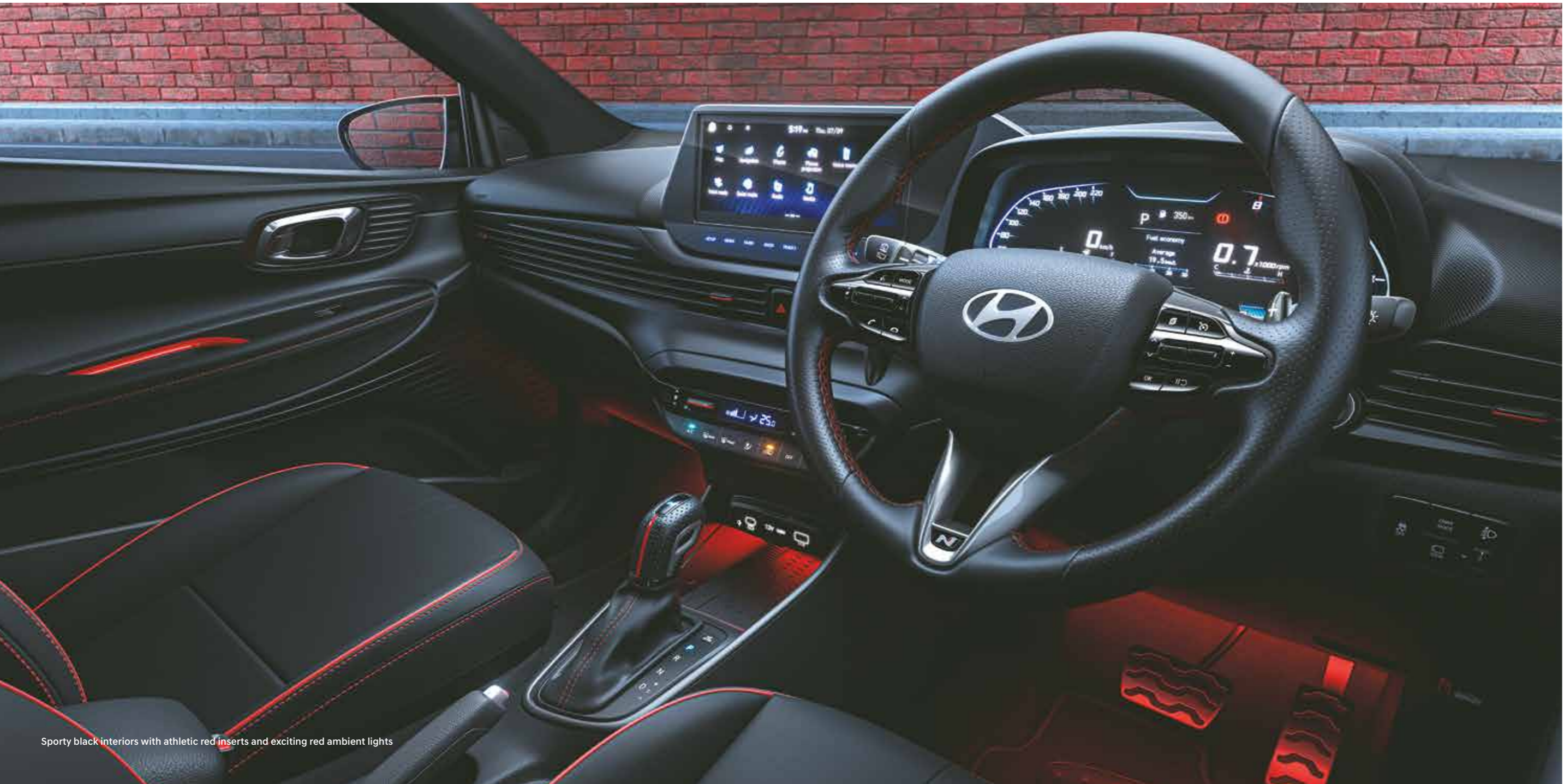
Sporty black interiors with athletic red inserts and exciting red ambient lights