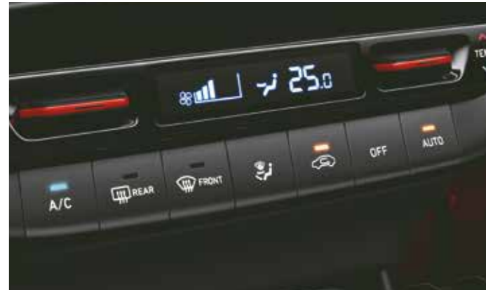
FATC with digital display

Other features: Smart entry with push button start/stop