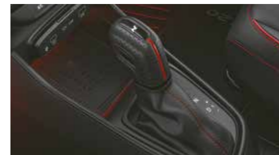
7 speed DCT (Dual clutch transmission)