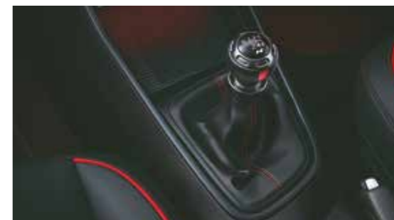
6-speed MT (Manual transmission)