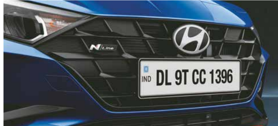
Sporty black radiator grille

Athletically aesthetic, the new Hyundai i20 N Line is built to command attention, all the way from the subtle chrome garnish on the foglamps to the tailgate spoiler with side wings. The sporty red highlights accentuate the performance inspired design, ensuring that all eyes are always on you.