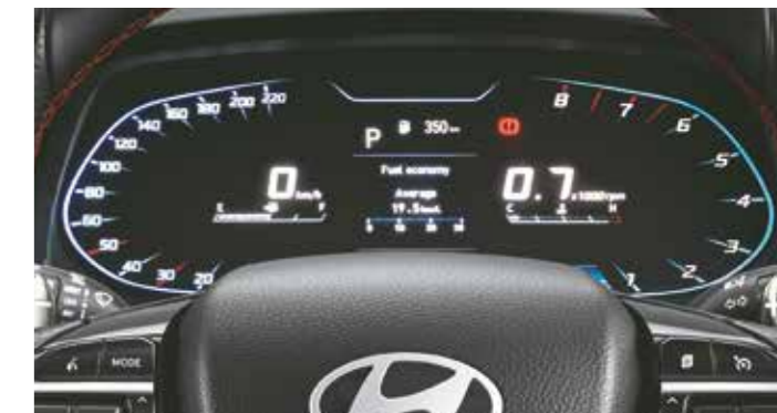
Digital cluster with TFT multi information display

Other features: Perforated leather wrapped gear knob with N logo | Sliding front armrest | Sporty metal pedals Dark metal finish inside door handles | Fast USB charger (Type C)