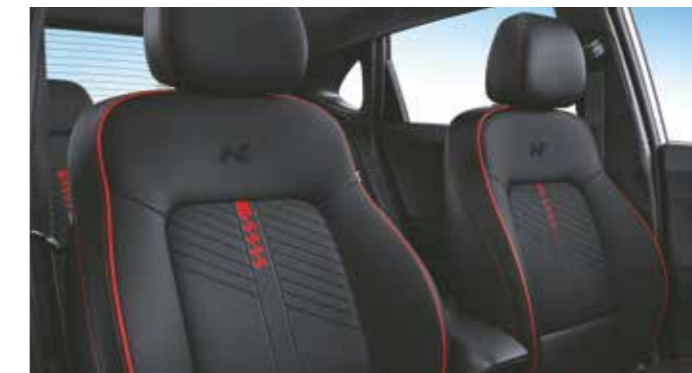
Chequered flag design leather seats with N logo