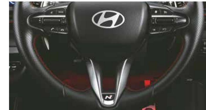
3-spoke steering wheel with N logo