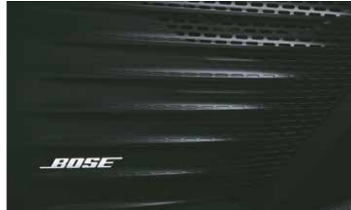
Bose premium 7 speaker system