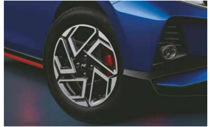
Front and rear disc brakes