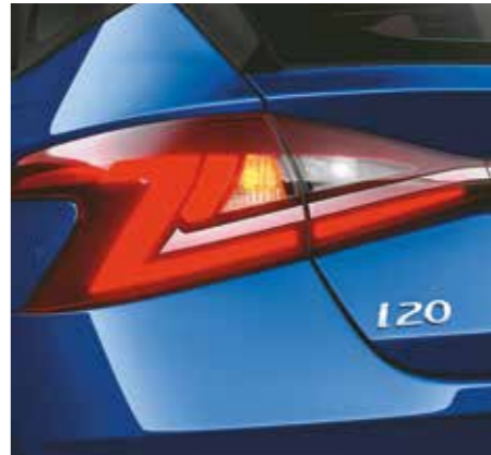
Z-shaped LED tail lamps