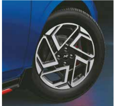
R16 (D=405.6 mm) Diamond cut alloy wheels