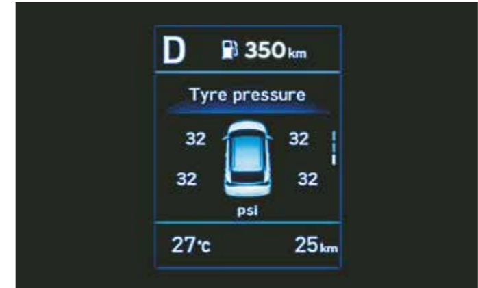
Tyre pressure monitoring system (highline)