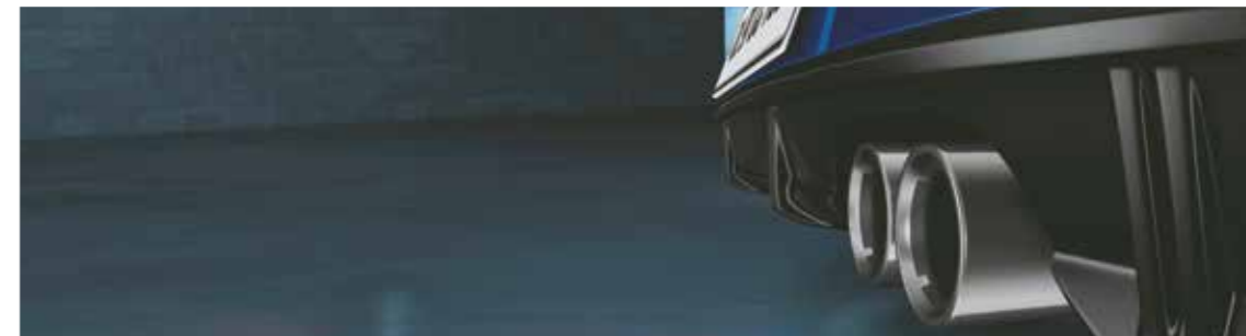
Sporty twin tip muffler

88.3 Maximum power kW (120 PS) @ 6 000 r/min