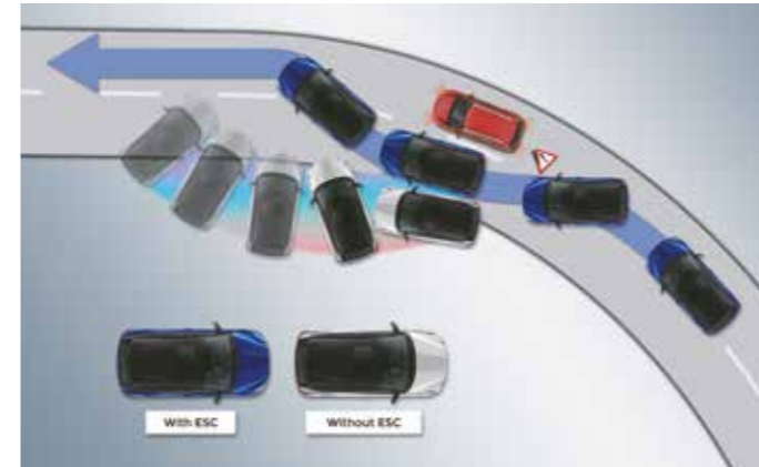
Electronic stability control (ESC) & Vehicle stability management (VSM)