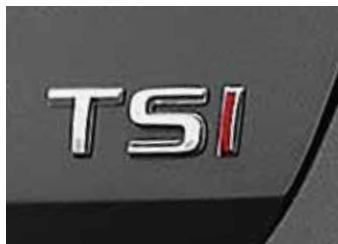
Powerful TSI Engine