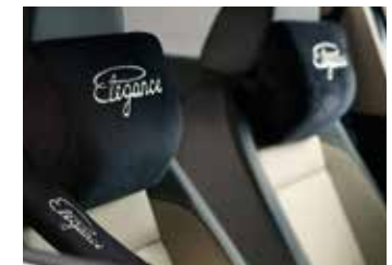
Elegance Seat Belt Cushion Cover