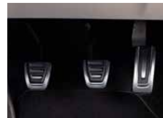
Alu Foot Pedals