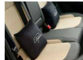
Elegance Cushion Pillows