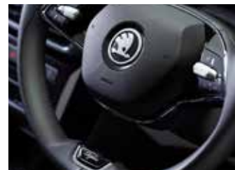
Elegance Steering Badge