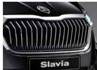
Chrome Grille Garnish